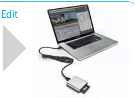
Insert CF media into a 3rd-party reader and attach to an Apple MacBook Pro or Apple Mac Pro. Copy media to Mac and import footage into Final Cut Pro. Edit. Simple .

After recording clips, remove the CF Card from Ki Pro Mini and you're ready to begin editing. No log and capture required.